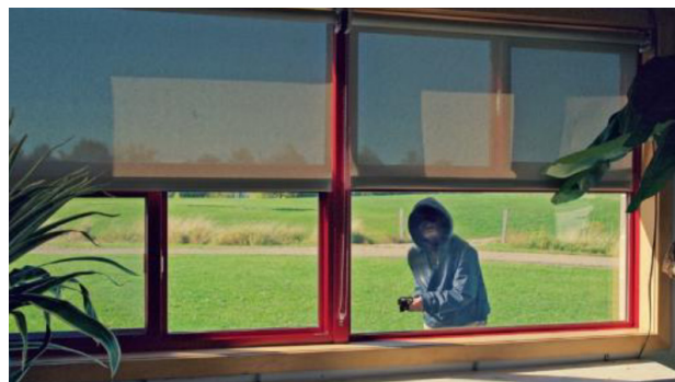
Teacher sees someone approach the classroom with a gun.

The synchronized lowering of all shades will create safer spaces while providing a visual alert to anyone in the school or yard. Valuable time will be saved to deter the threat, protect the students, and engage emergency personnel.